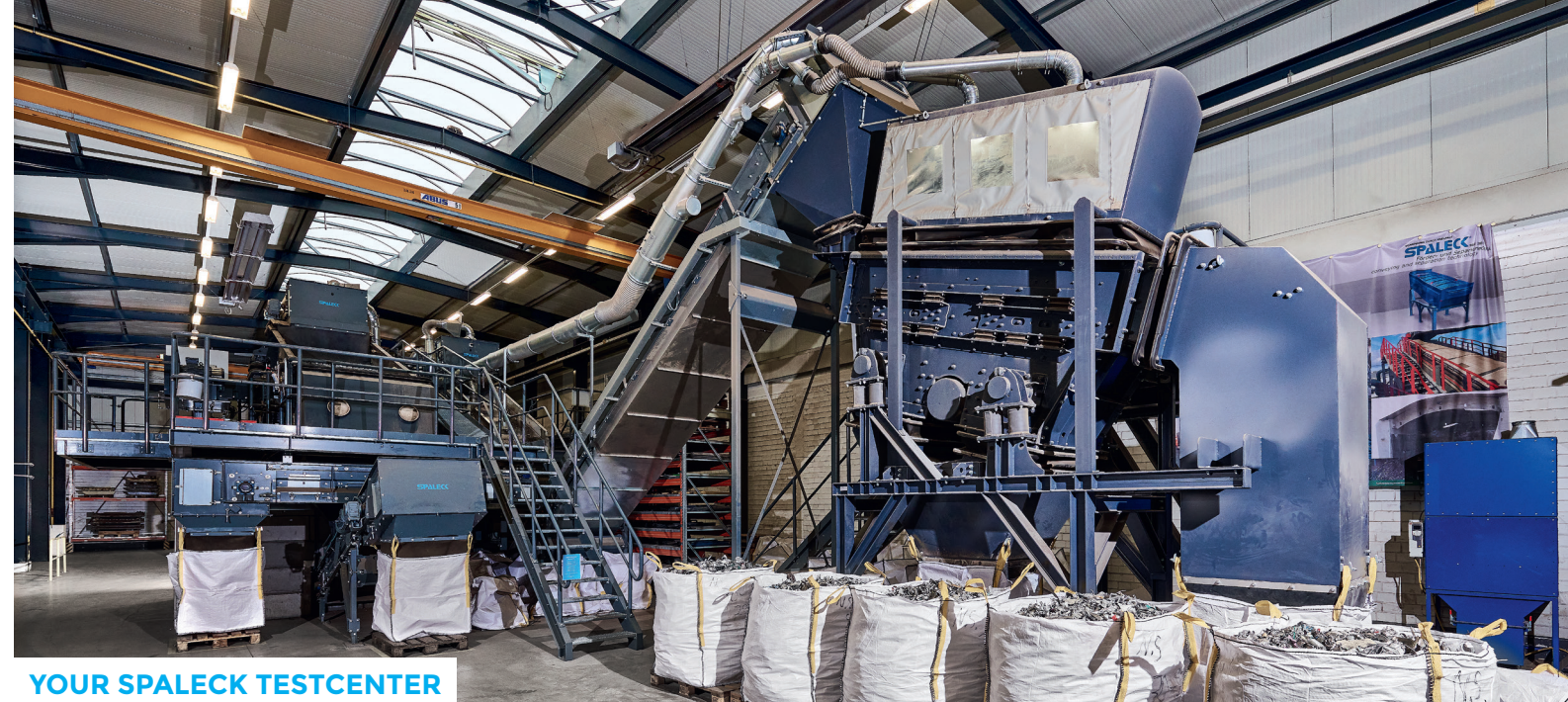
YOUR SPALECK TESTCENTER

Our SPALECK ActiveFEED technology protects the environment and pays off at the same time! The optimised throughput performance on your sorters pays for itself quickly & noticeably!